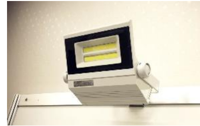
■ LED Light (LED, 60W, white) Rental fee : 14,000 JPY