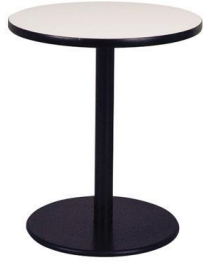
■ Round table_A Rental fee : 7,000 JPY Size : Φ600×H700mm Color : White

All products are subject to a 15% Service fee and 10% Consumption tax. Below prices are not included a service fees and consumption tax. すべての備品には15%の営業管理費と10%の消費税が加算されます。