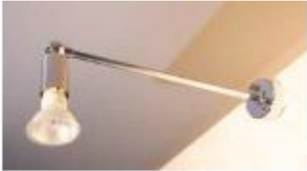
■ Armspot Light Long (LED, 10W, white) Rental fee : 7,000 JPY