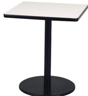
■ Square table_B Rental fee : 8,000 JPY Size : W600×D600×H700mm Color : White