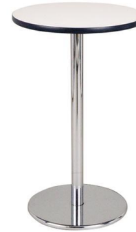
■ Round table_C Rental fee : 8,000 JPY Size : Φ600×H1000mm Color : White