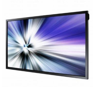
■ LCD display 55inch Rental fee : 140,000 JPY Size : W1250×D57×H721 Color : Black ※HDMI cable included

All products are subject to a 15% Service fee and 10% Consumption tax. Below prices are not included a service fees and consumption tax. すべての備品には15%の営業管理費と10%の消費税が加算されます。