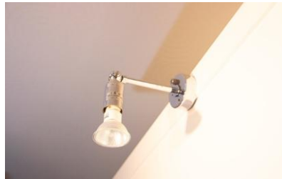
■ Armspot Light Short (LED, 10W, white) Rental fee : 6,000 JPY