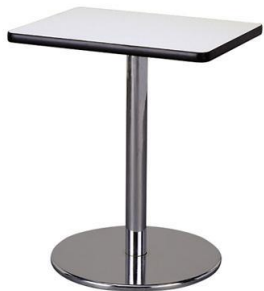
■ Square table_A Rental fee : 7,000 JPY Size : W600×D450×H700mm Color : White