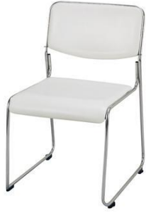
■ Stacking chair Rental fee : 2,000 JPY Size : W485×D490×H755 SH420mm Color : White

All products are subject to a 15% Service fee and 10% Consumption tax. Below prices are not included a service fees and consumption tax. すべての備品には15%の営業管理費と10%の消費税が加算されます。