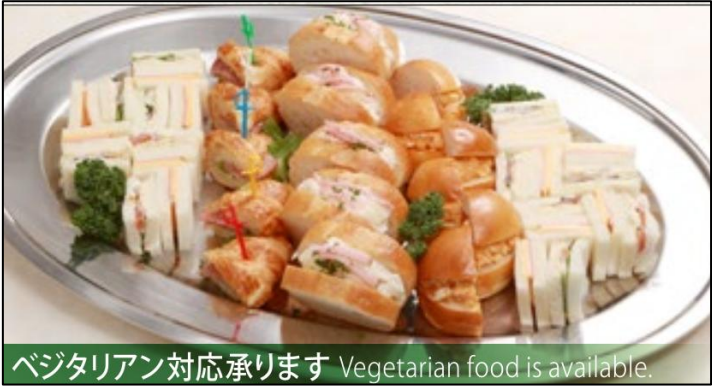
ベジタリアン対応承ります Vegetarian food is available.

All products are subject to a 15% Service fee and 10% Consumption tax. Below prices are not included a service fees and consumption tax. すべての備品には15%の営業管理費と10%の消費税が加算されます。