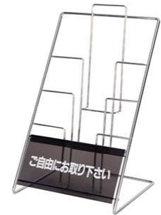
■ Catalogue stand_B (1column, 3columns, A4vertical) Rental fee : 5,000 JPY Size : W450×D390×H600mm Color : Silver