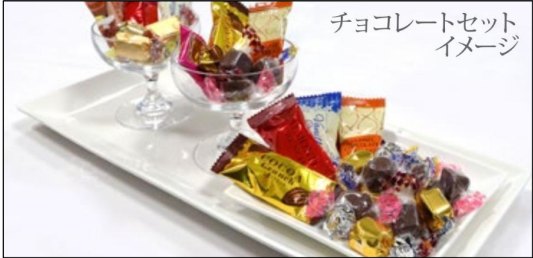
Chocolate set 3,200 JPY (1set=15 pieces)