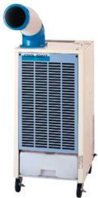
■ Spot Cooler (100V only) Rental fee : 25,000 JPY