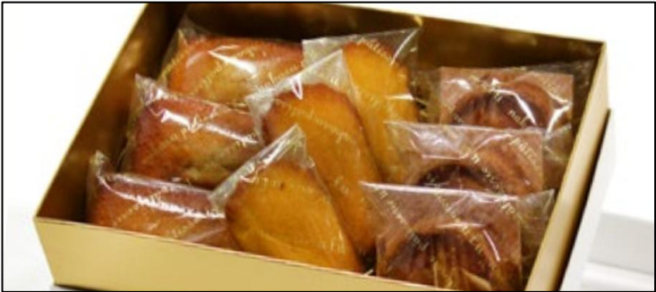
Baked sweets 3,800 JPY (1set = 9 pieces)