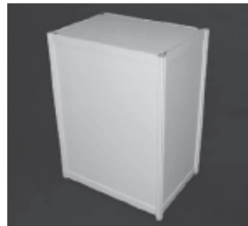
■ System display stand_B Rental fee : 13,000 JPY Size : W700×D495×H1,000mm Color : White