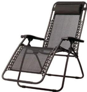
■ Reclining chair Rental fee : 6,000 JPY Size : W640×D930×H1120 (W640×D1,650×H820) Color : Black