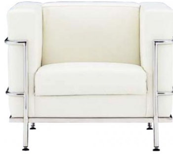
Armchair B No. C-004 CODE : 1062081 Rental fee : 40,000 JPY Size : W900 x D820 x H725 (SH420) Material : Synthetic leather, Color: White