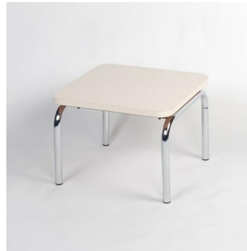
Side table No : T-008B CODE : 821004 Rental fee : 7,000 JPY Size : W550 x D550 x H420 Material・Color : Top panel / melamine (ivory), Legs / chrome plating