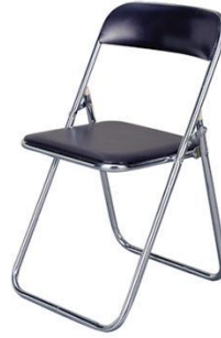
■ Folding chair Rental fee : 1,000 JPY Size : W420×D460×H740 SH430mm Color : Brown