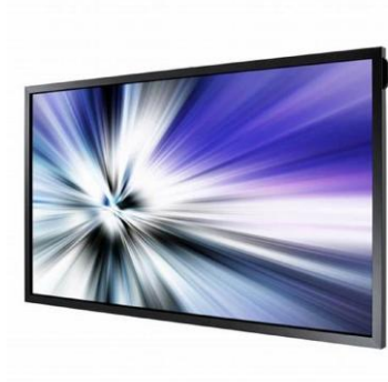
■ LCD display_43inch Rental fee : 130,000 JPY Size : W969 ×H560 ×D61mm Color : Black ※HDMI cable included