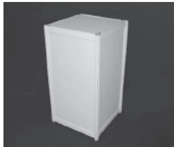
■ System display stand_A Rental fee : 12,000 JPY Size : W495×D495×H1,000mm Color : White