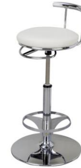
■ Stand chair Rental fee : 7,000 JPY Size : W365×D430×H905 (SH600~750mm) Color : White