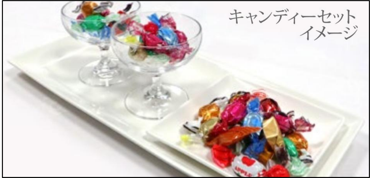
Candy set 2,000 JPY (1set=15 pieces)