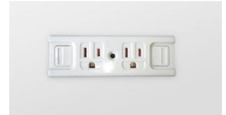
■ Electrical outlet (100V only) Rental fee : 3,000 JPY