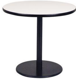
■ Round table_B Rental fee : 8,000 JPY Size : Φ750×H700mm Color : White