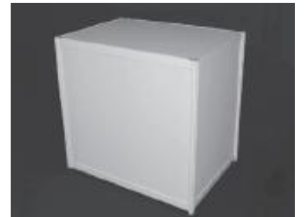
■ System display stand_D Rental fee : 15,000 JPY Size : W990×D700×H1,000mm Color : White