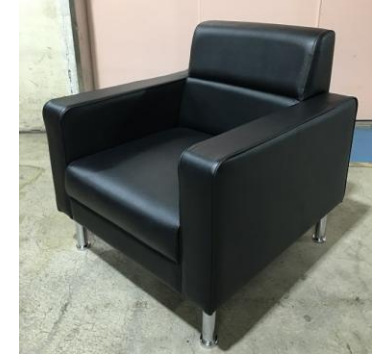
Armchair C No. C-006 CODE : 1062001 Rental fee : 28,000 JPY including tax Size : W740 x D780 x H790 (SH400) Material : Synthetic leather, Color: Black