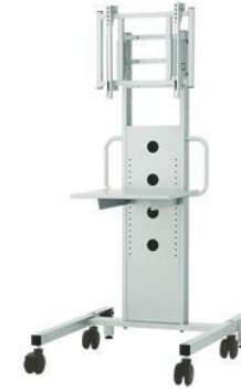
■ Display stand Rental fee : 35,000 JPY Size : W800×D680×H1638 Color : Silver ※For 37" to 55"Display