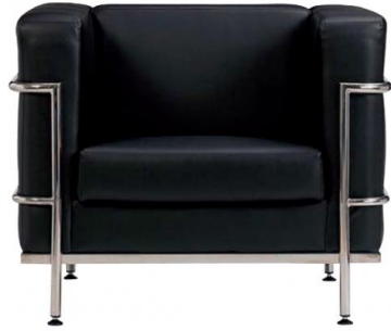
Armchair-A No. C-002 CODE : 1062081 Rental fee : 40,000 JPY Size : W900 x D820 x H725 (SH420) Material : Synthetic leather, Color: Black

All products are subject to a 15% Service fee and 10% Consumption tax. Below prices are not included a service fees and consumption tax. すべての備品には15%の営業管理費と10%の消費税が加算されます。