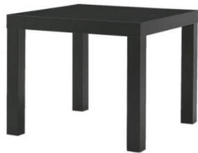
Side table No : T-500B CODE : 5001001 Rental fee : 5,800 JPY Size : W550 x D550 x H450 Color : Black