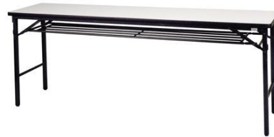
■ Table_A Rental fee : 3,500 JPY Size : W1800×D450×H700mm Color : White