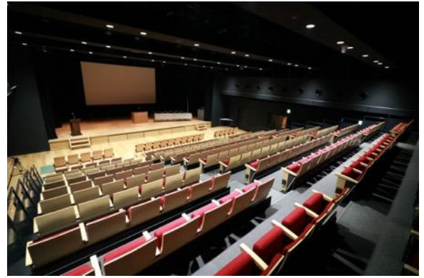
Fukuoka City Science Museum Science Hall (300 seats)

Dome diameter: 25 m (horizontal) Facilities: In addition to existing facilities, more than six 10,000-lumen 4K projectors are planned to be temporarily installed for IPS use (and can be used for presentations). Please consult separately regarding how to bring in equipment, etc.