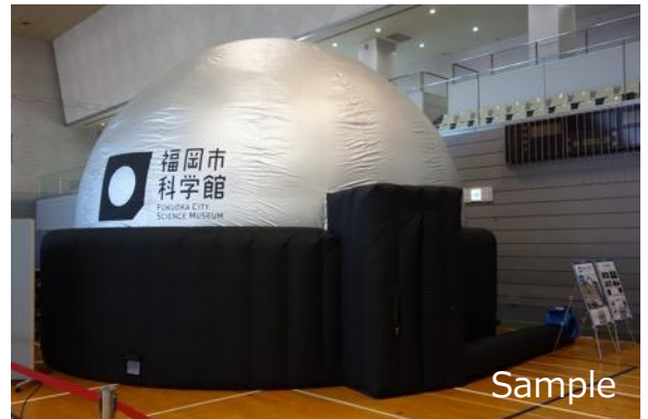
Fukuoka International Center Temporary Dome (20-40 seats)

*Actual product may differ from the photo.