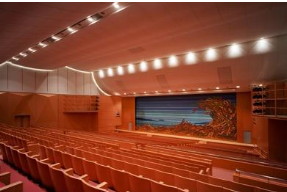
Fukuoka International Congress Center Main Hall (1,000 seats)

Equipment: 4K projector (can be used for presentations)