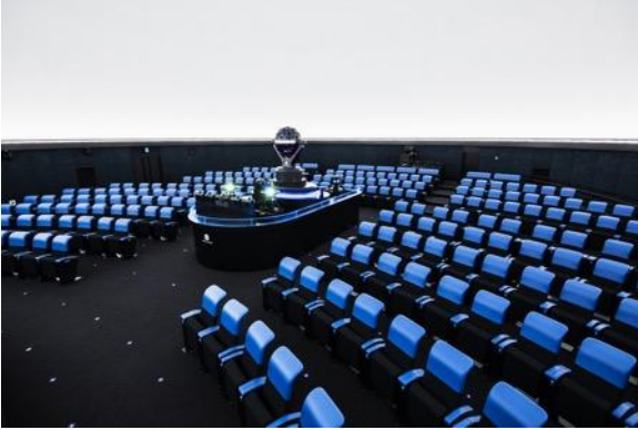
Fukuoka City Science Museum Dome Theater (220 seats)

Presentations is available according to the contents of each package.