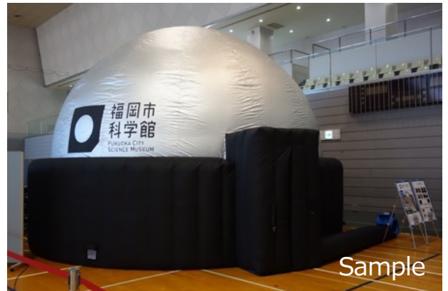
Fukuoka International Center Temporary Dome (20-40 seats)

*Actual product may differ from the photo.