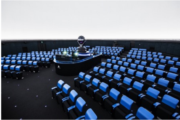
Fukuoka City Science Museum Dome Theater (220 seats)

Presentations is available according to the contents of each package.