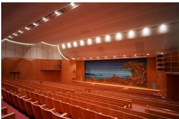
Fukuoka International Congress Center Main Hall (1,000 seats)

Equipment: 4K projector (can be used for presentations)