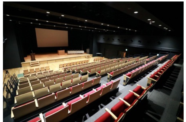
Fukuoka City Science Museum Science Hall (300 seats)

Dome diameter: 25 m (horizontal) Facilities: In addition to existing facilities, more than six 10,000-lumen 4K projectors are planned to be temporarily installed for IPS use (and can be used for presentations). Please consult separately regarding how to bring in equipment, etc.